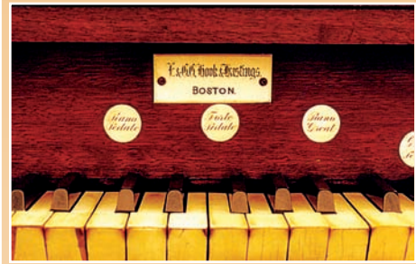
The 1875 E. & G. Hook & Hastings. The largest extant 19th century organ in Chicago.